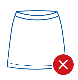
No skirts 61% prefer not to wear skirts during school sport , 57% prefer not to wear skirts during sport outside of school

"Netball dresses are breezy which is good, but it's annoying when you bend over or it's windy and everyone can see your butt"