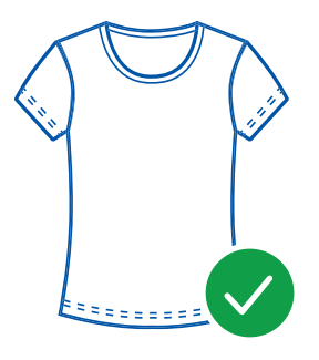
T-shirts 94% prefer to wear t-shirts during school sport , 86% prefer to wear t-shirts during sport outside of school